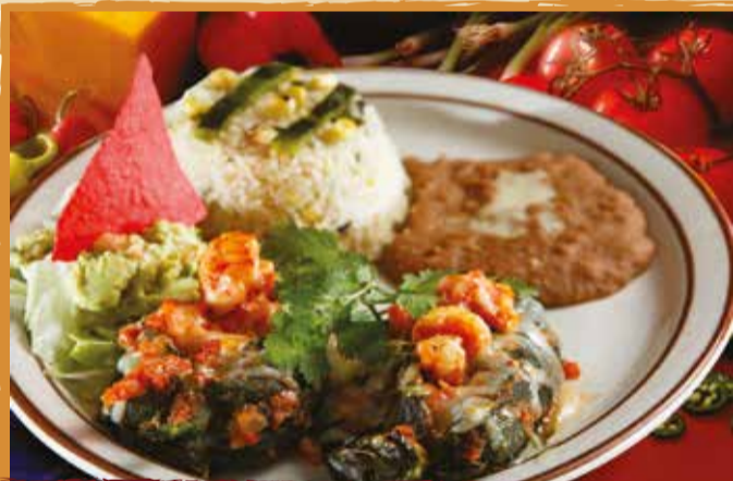
CHILES RELLENOS DE CAMARON