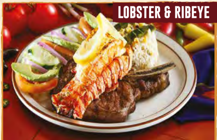
LOBSTER & RIBEYE