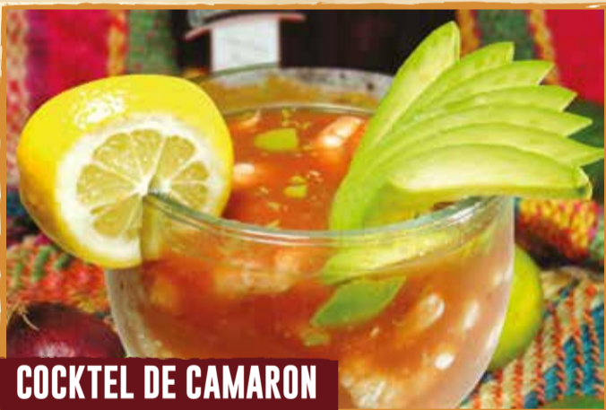
COCKTEL DE CAMARON

Mexican style shrimp SM $11.00 MD $13.50 LG $18.00